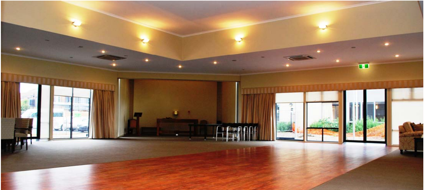
Corpus Christi Village Community Centre: view of dance floor and Chapel.