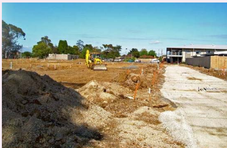
The site of Corpus Christi Village at 1 Bayview Avenue, Clayton.