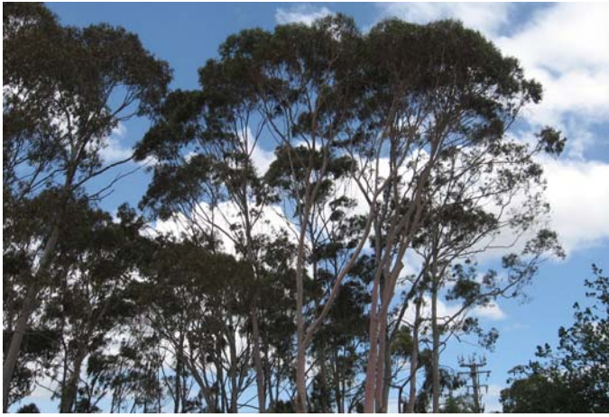
The splendid mature gum trees at Corpus Christi Village.